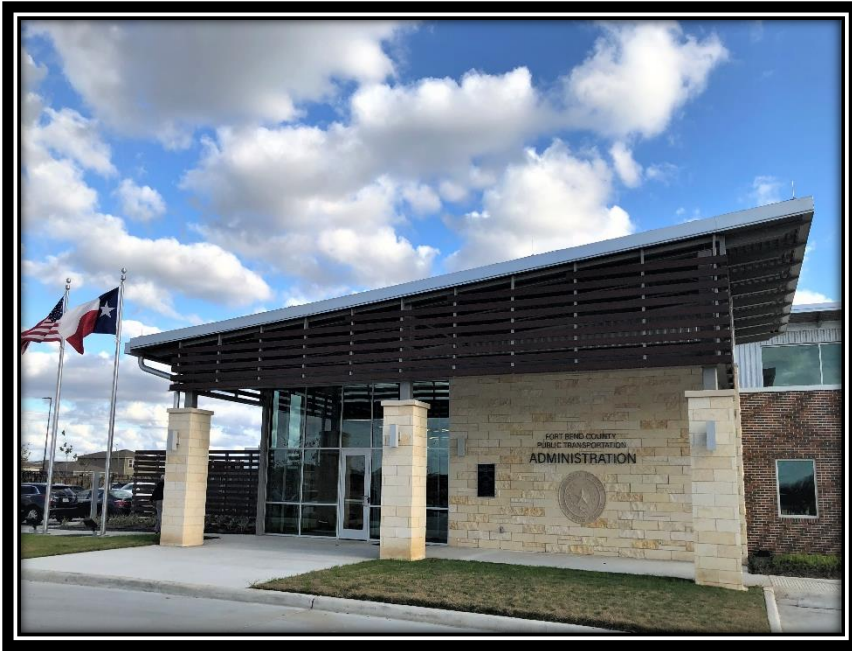
Fort Bend Transit Administrative Building

The Texas Chapter of the American Public Works Association (TPWA) has selected the Fort Bend County Public Transportation Facility project for its 2020 Project of the Year Award.