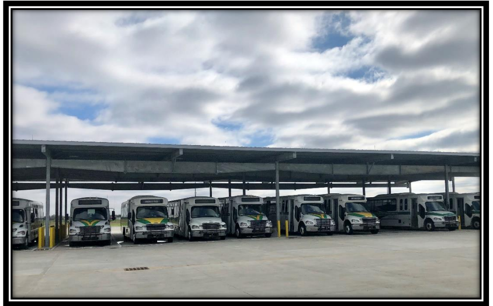
Covered Parking for Bus Fleet

Fort Bend Transit currently offers shared ride bus services and commuter services to the citizens and/or visitors of Fort Bend County. Shared ride bus service stay within the County while commuter service provide service to the Texas Medical Center, Greenway Plaza, and the Galleria. Commuter service may begin as early as 4:30 a.m. and end as late as 9:00 p.m. There is no weekend service.