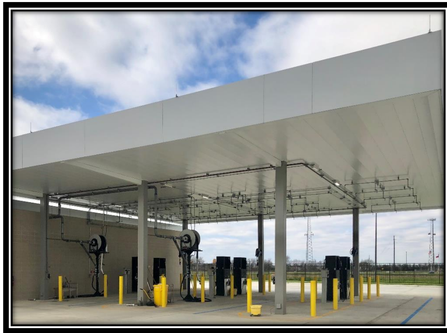
Fort Bend Transit Fuel Station

For more information about Fort Bend Transit please visit our website at www.FBCTransit.org or give us a call at 281-633-RIDE(7433).