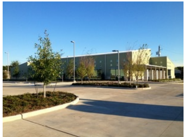
Current view of the PINNACLE Center (October 2013)

We are extremely delighted that the progress of the much awaited Senior Community Center in Fort Bend County is going smoothly and is scheduled to be opened before the end of the year!