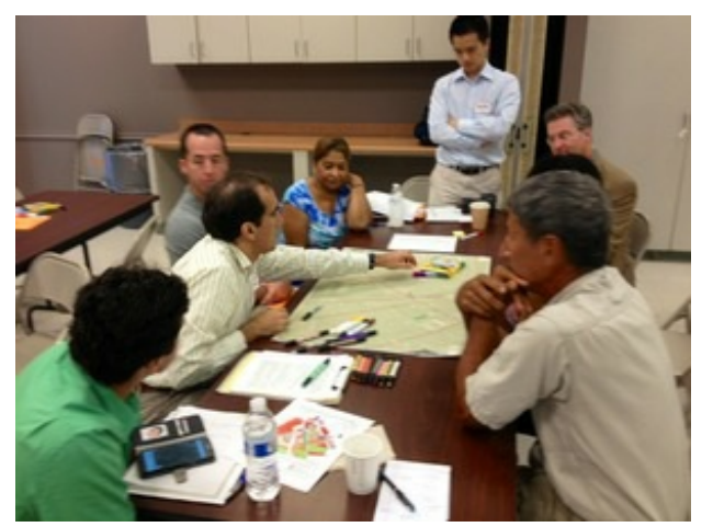
Community residents working together to pinpoint where they would like to see certain amenities on Fifth Street.

For detailed information on the mobility projects, please visit the <u>Proposed</u> <u>Mobility Projects</u> page.