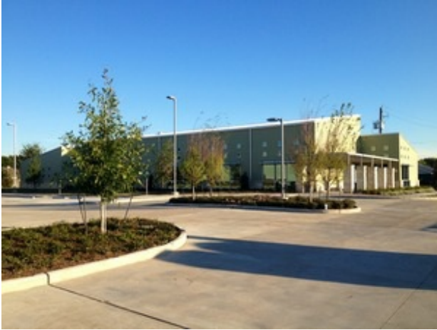
The PINNACLE Center

Fort Bend County leaders are inviting residents to the Grand Opening and Ribbon-Cutting Ceremony for the new PINNACLE Senior Center, 5525#C Hobby Road, Houston, Texas 77053 [located across from Christie McAuliffe Middle School], at 10a.m. on Friday, February 14, 2014.