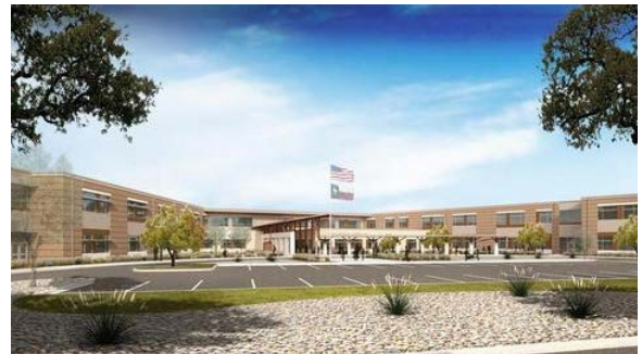
(A rendering of James C. Neill Elementary)

As a part of the program, the three new schools, Donald Leonetti Elementary School in the Sienna Plantation master-planned community, James C. Neill Elementary in the Harvest Green master-planned community and James Patterson Elementary in the Grand Vista subdivision will meet LEED/high-performance standards and obtain LEED certification.