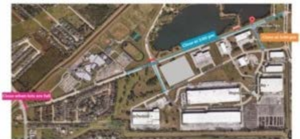
Road Closure Schedule

Beginning at 3 p.m. on Tuesday, July 4 th , event parking traffic will only be allowed