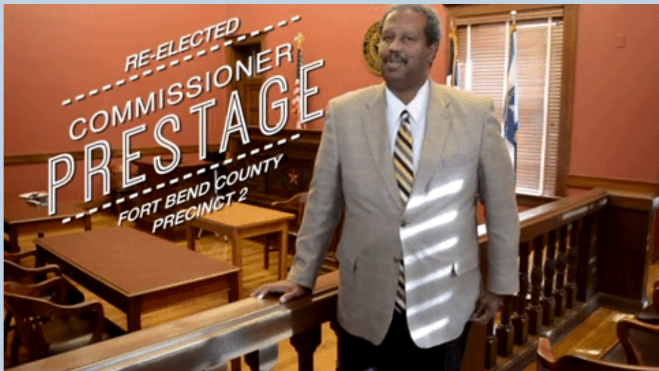
(Click Video to Watch)