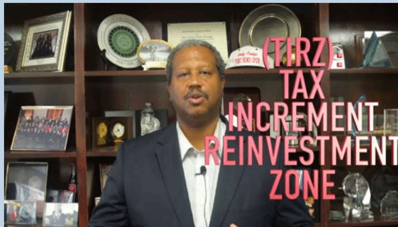
(Click Video to Watch)