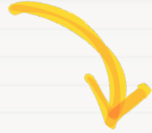
Table of Contents!