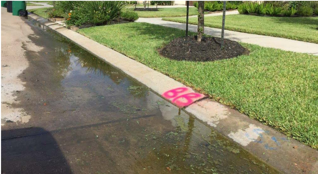
Image 1 - Bird bath extends into driving lane; corrective measures required.

Light grinding may be done within 6 inches of the curb and no more than 1/2 inch in depth. Grind must be “feathered” so as not to create an edge.