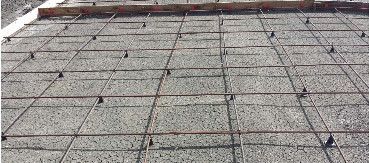
Image 5 - Subgrade is too dry.

The information below is to assist developers, engineers, contractors, and inspectors on identifying conditions that may lead to inadequate pavement structures and costly pavement replacement upon construction completion.