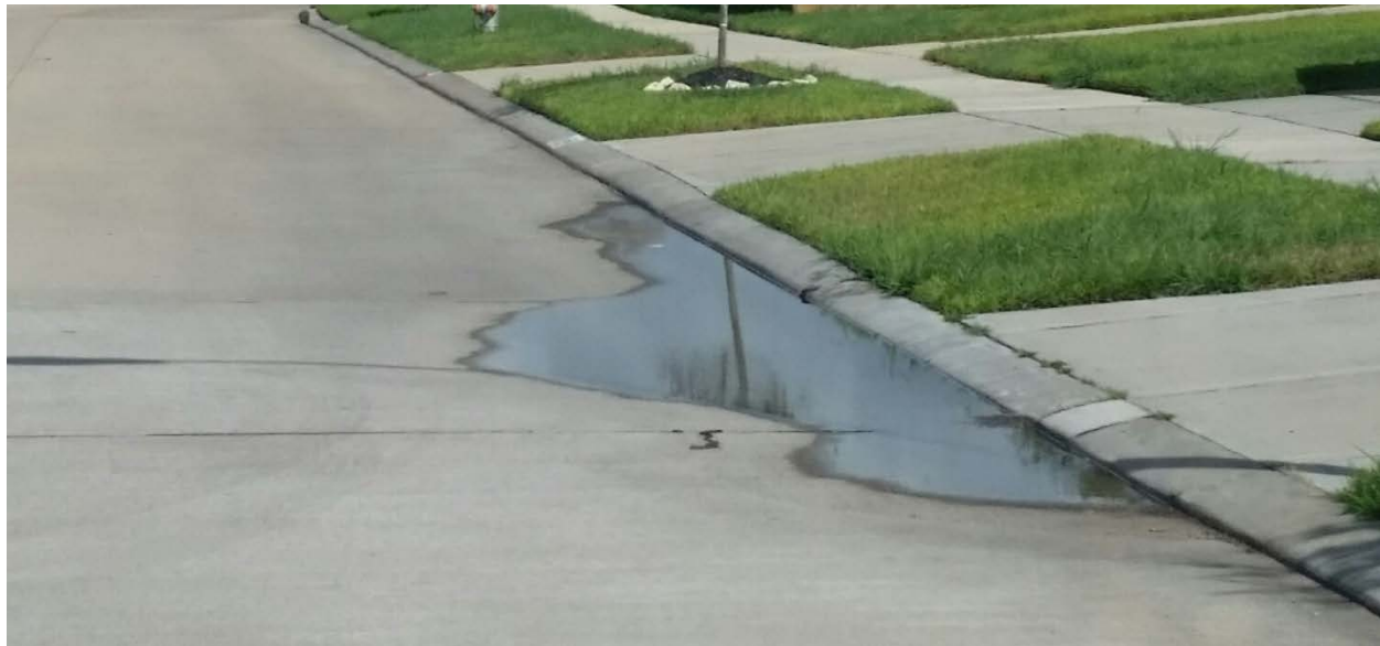
Image 3 - Bird bath has significant length, width, and depth. Lifting or pavement replacement is required. If the lifted pavement cracks then use Concrete Pavement Cracking Evaluation Criteria included in this document.