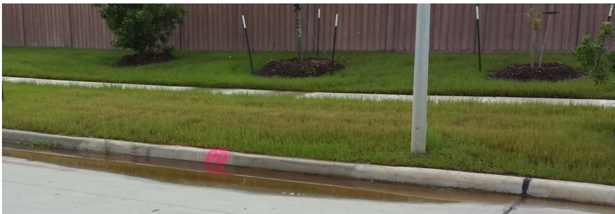
Image 2 - Bird bath has significant length and depth. Lifting, light grinding, or removal of joint sealant obstruction may be acceptable based on field conditions. Grinding shall be limited to 15' either side of the expansion joint.