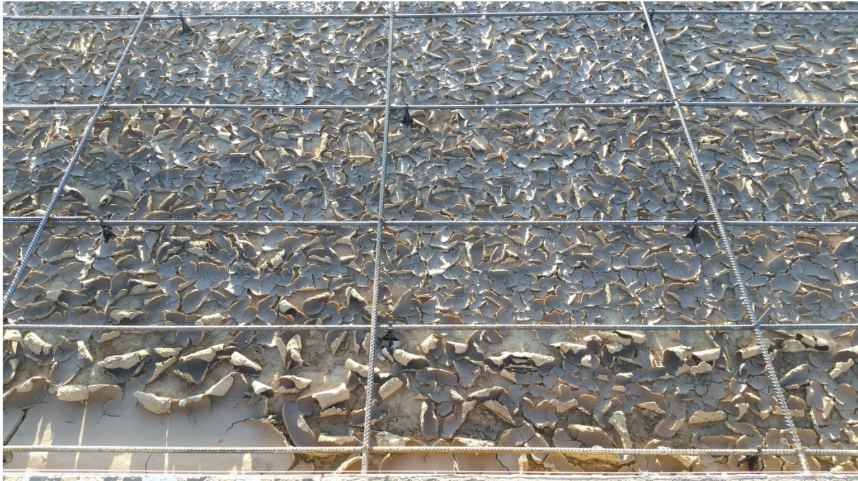
Image 6 - Subgrade is too dry.