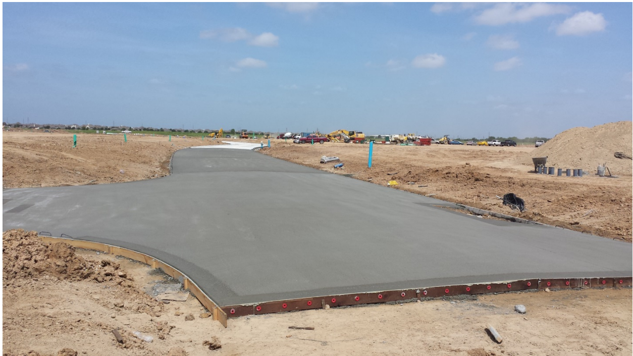
Image 11 - Membrane curing compound not applied to pavement