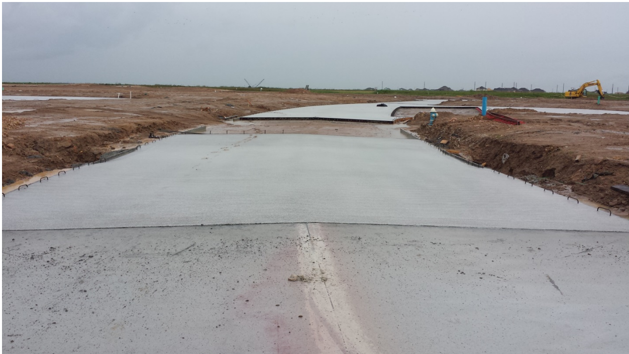
Image 15 - Not saw cutting within specified time (photo shows 4 day old concrete with no sawcuts)