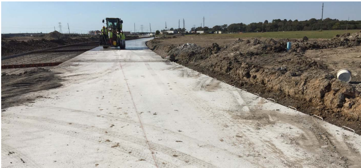
Image 16 - Equipment operating on pavement with inadequate cure time.