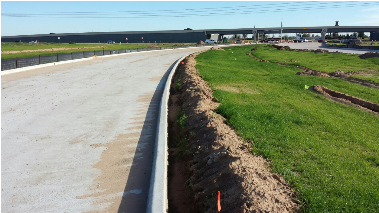
Image 13 - Silt fence or irrigation is placed directly behind curb cuts through subgrade and impacts lateral support.