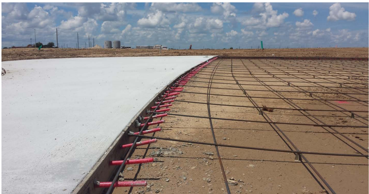
Image 10 - Misaligned dowels may cause spalling near the joint.