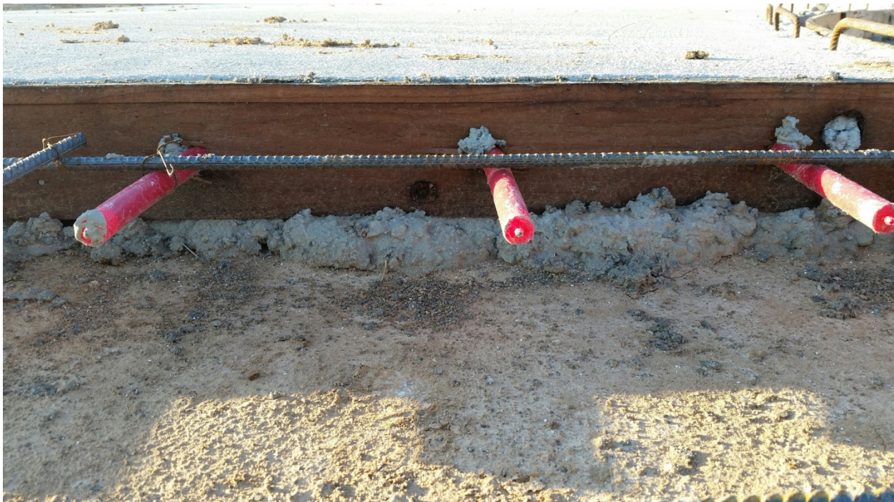
Image 8 - Concrete under headers at expansion joints does not allow expansion to occur correctly.