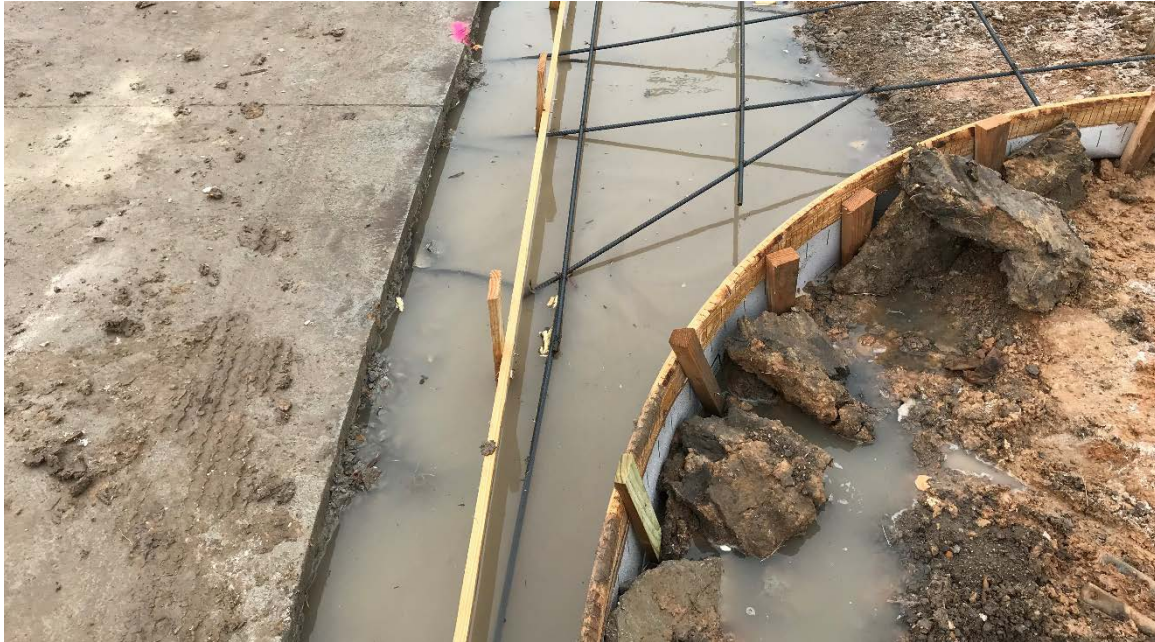
Image 17 - Driveway cut with water sitting weakens the subgrade