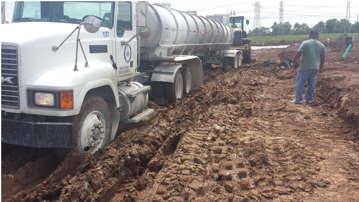
Image 7 - Possible deficiencies in subgrade and base include: Inadequate proof rolling or improper mixing of lime for subgrade, not extending lime mixture to edges of proposed limits of the stabilized subgrade, calculating lime for a 6 inch subgrade and mixing it 8 or more inches deep.