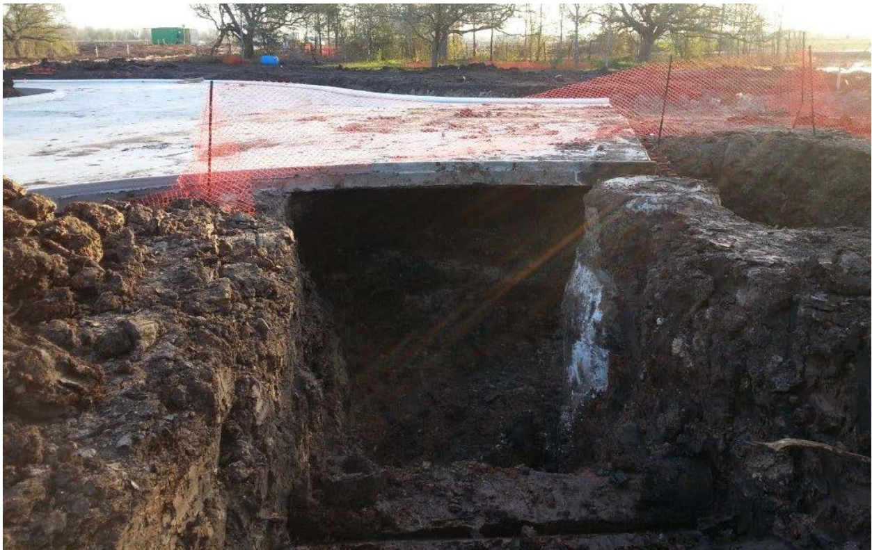
Image 14 - Excavation under or near pavement