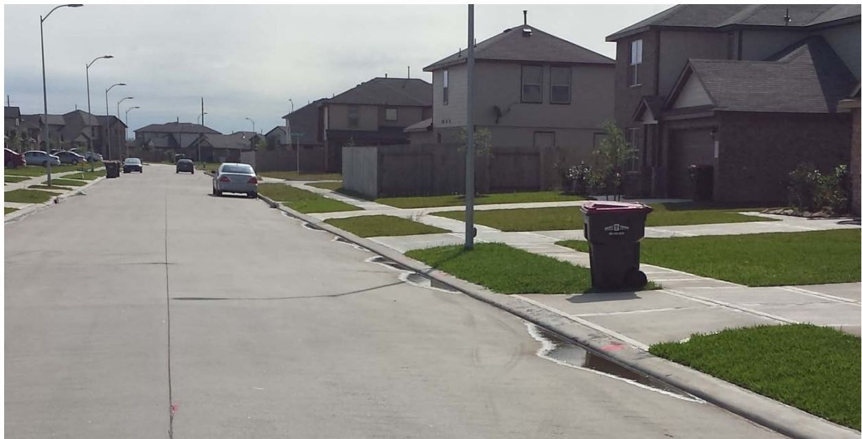
Image 4 - Bird baths which are relatively small in length, width, and depth do not require pavement replacement or lifting. Allowable width is approximately 12 inches.