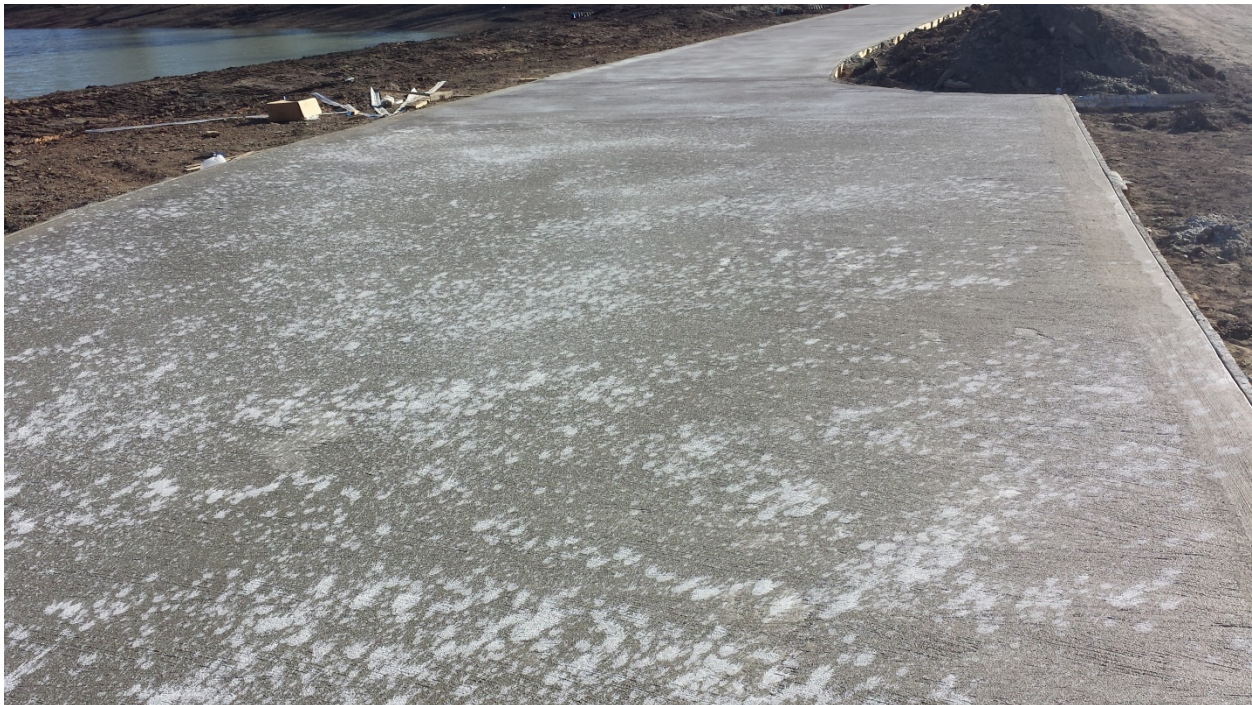
Image 12 - Inadequate curing compound