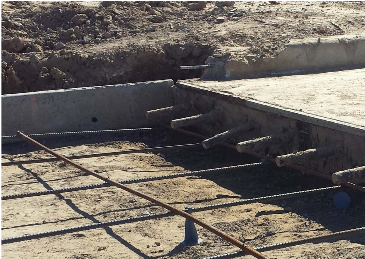
Image 9 - Misaligned dowels may cause spalling near the joint.