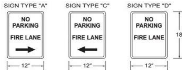
FIGURE D103.6 FIRE LANE SIGNS

Where required by the fire code official , fire apparatus access roads shall be marked with permanent "NO PARKING FIRE LANE" signs complying with Figure D103.6, or other approved method. Signs shall have a minimum dimension of 12 inches (305 mm) wide by 18 inches (457 mm) high and have red letters on a white reflective background. Signs shall be posted on one or both sides of the fire apparatus road as required by Section D103.6.1 or D103.6.2.