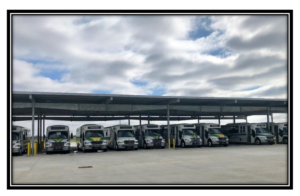
Fort Bend Transit Fuel Station

Fort Bend Transit currently offers shared ride bus services and commuter services to the citizens and/or visitors of Fort Bend County. Shared ride bus service stay within the County while commuter service provide service to the Texas Medical Center, Greenway Plaza, and the Galleria. Commuter service may begin as early as 4:30 a.m. and end as late as 9:00 p.m. There is no weekend service.