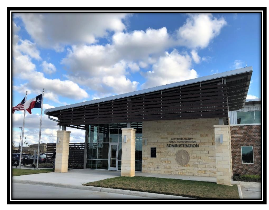
Fort Bend Transit Administrative Building

The Texas Chapter of the American Public Works Association (TPWA) has selected the Fort Bend County Public Transportation Facility project for its 2020 Project of the Year Award.